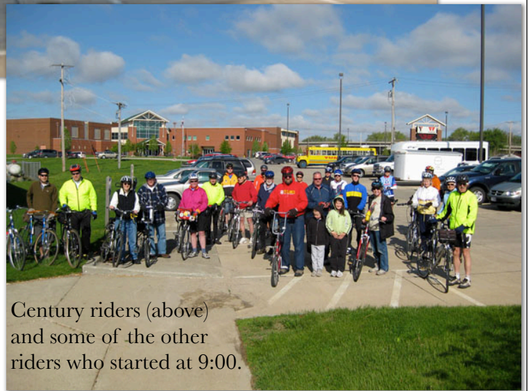
Century riders (above) and some of the other riders who started at 9:00.