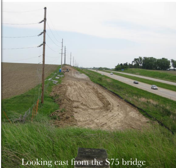
Looking east from the S75 bridge

Quote of the Month: Life is like riding a bicycle - in order to keep your balance, you must keep moving. ~Albert Einstein