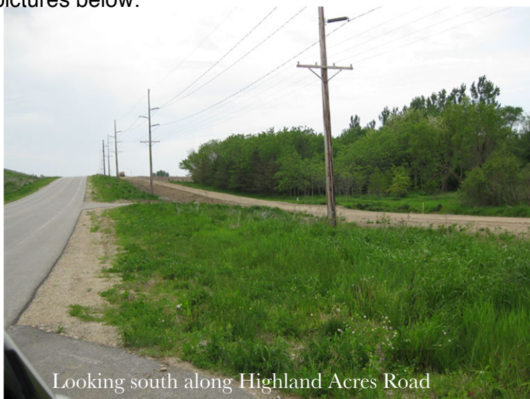
Looking south along Highland Acres Road

If one has not driven Iowa Avenue west of Marshalltown, please do so, and check the progress on the Connecting Trail. Look out Melbourne, we will soon be headed your way. Check out the pictures below: