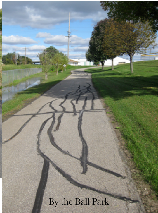
By the Ball Park

Repair work on the Linn Creek Trail this fall consisted of filling the cracks on the trail and a new seal coat on the trail from E. Main St. to Riverview Park. You may have noticed more changes to the trail in the past year and that is because of the increased use of the trail. The old "emergency 911" numbers have been covered by the seal coat, but a new system will replace the old 911 numbers. IVBC has received