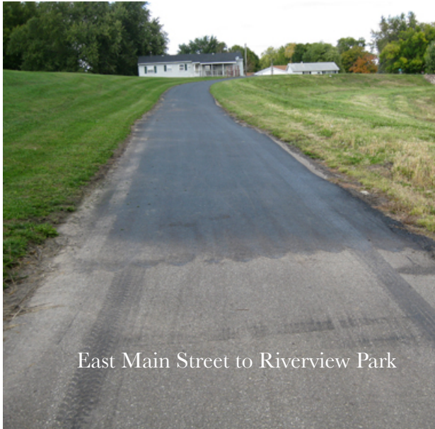
East Main Street to Riverview Park